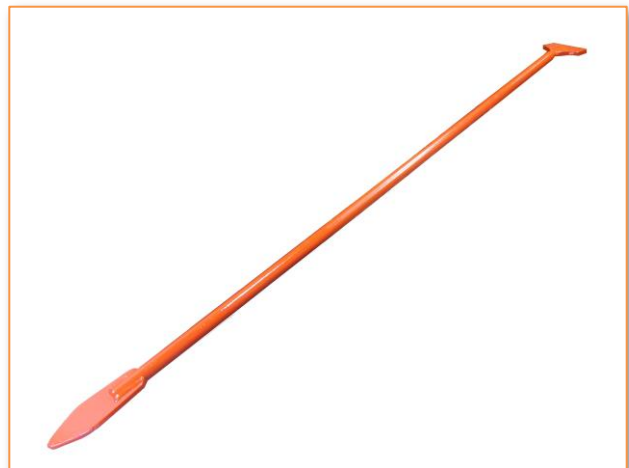
2310118C "Javelin" Point Lightweight Tamping Bar

The 2310118C "Javelin" point tamping bar is a lightweight variant of 2310118B, with a 62" long 1-1/16" diameter high-carbon steel handle, with one spear-point end and one tamping end. Painted safety orange.