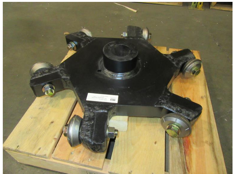
Round Adzer Bits installed on a 19", 6-arm Adzer Cutting Head with a 2" Taper (Part# ADKK19-2)